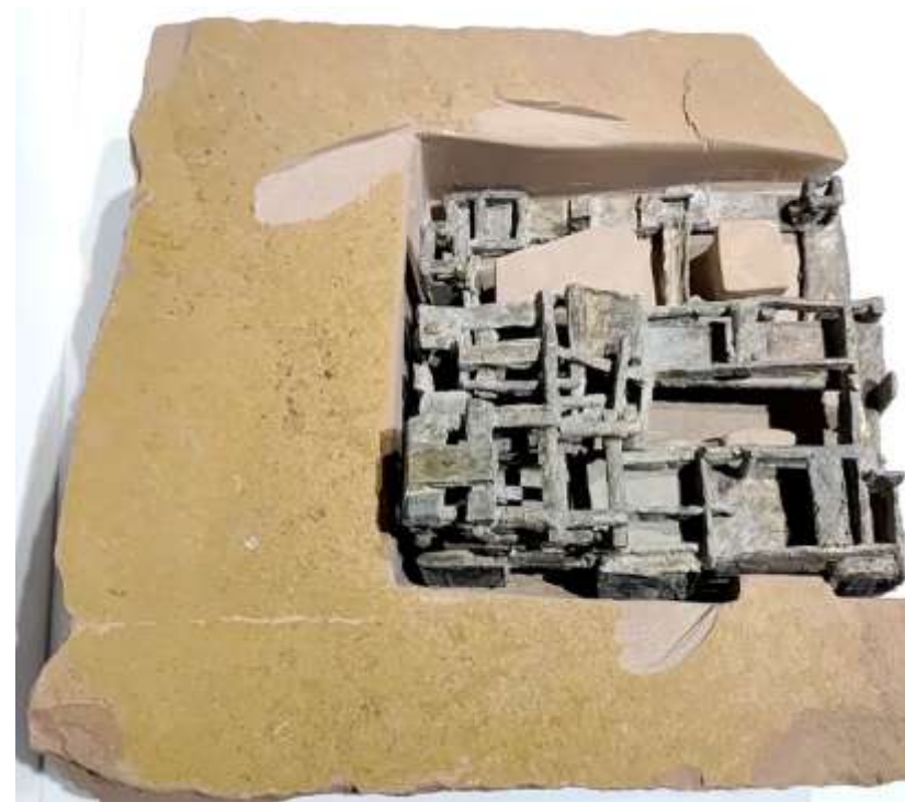
NO. 19 ABANDONED 19 Medium: Stone and Bronze Size: H- 5, W-19, B- 17 in. Year: 2023 - 2025