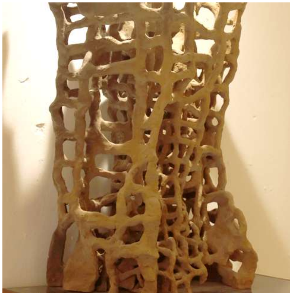
NO. 22 Growth #2 Medium: Terracotta Size: H-22, W-13, D-9 in Year: 2022