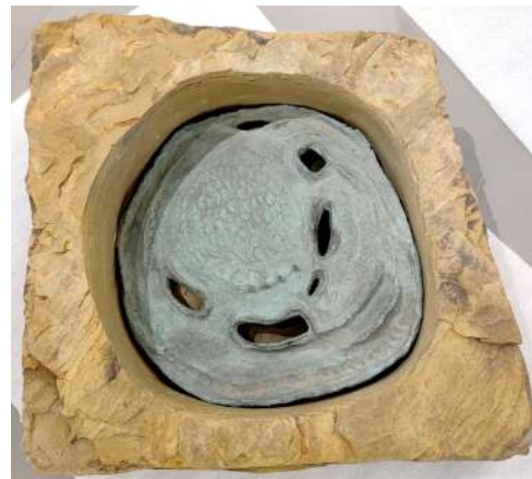
NO. 11 ABANDONED 11 Medium: Stone and Bronze Size: H- 7, W-13, D-12 in Year: 2023 - 2025