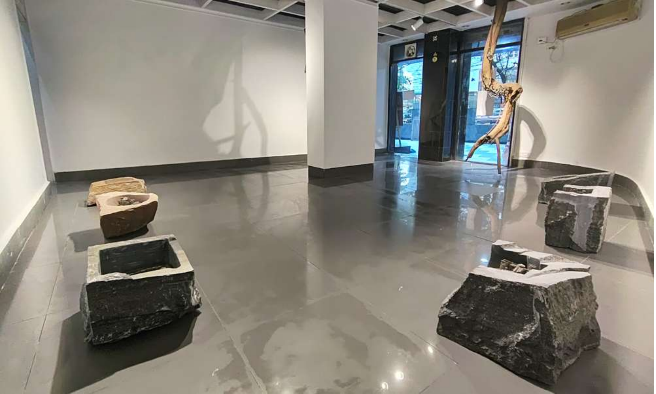
Latika Katt Earth Metal Memory Gallery View