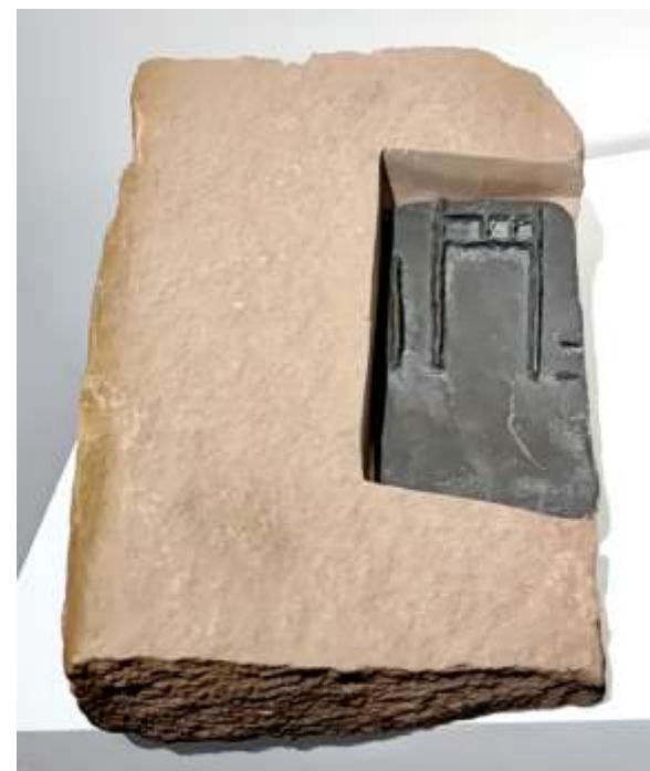
NO. 14 ABANDONED 14 Medium: Sandstone and Bronze Size: H-8, W-20, D-15 in Year: 2023 - 2025