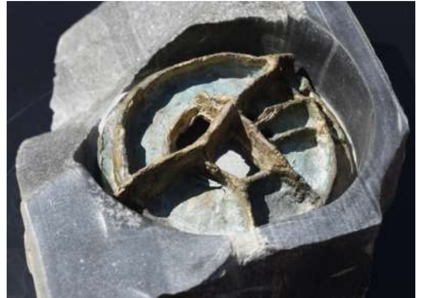
NO. 13 ABANDONED 13 Medium: Stone and Bronze Size: H- 8, W-20, D-15 in Year: 2023 - 2025