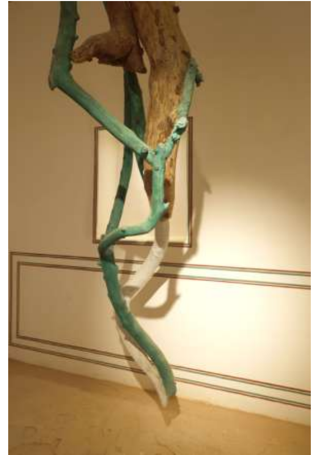
NO. 24 Figure, 2018 Medium: Wood Size: H-75, W-18, D-16 in Year: 2018