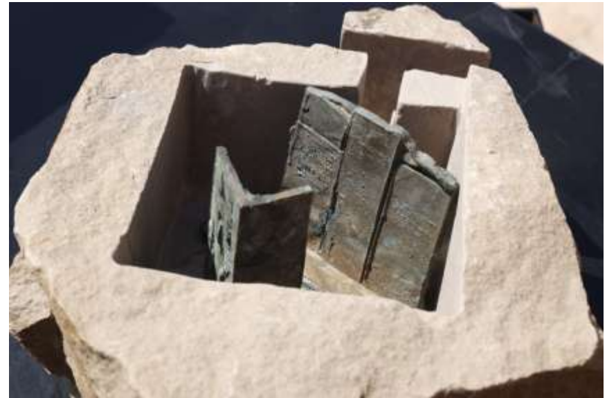
NO. 04 ABANDONED 4 Medium: Stone and Bronze Size: H-8, W-14, D-15 in Year: 2023 - 2025