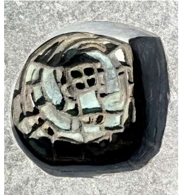
NO. 18 ABANDONED 18 Medium: Stone and Bronze Size: H-13, W-20, D-20 in Year: 2023 - 2025