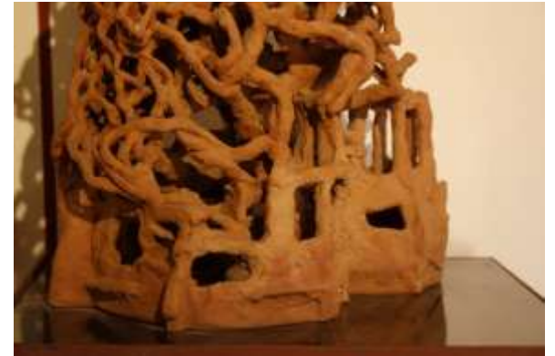
NO. 21 Growth #1 Medium: Terracotta Size: H-30 in, W-19, D-8 in Year: 2022