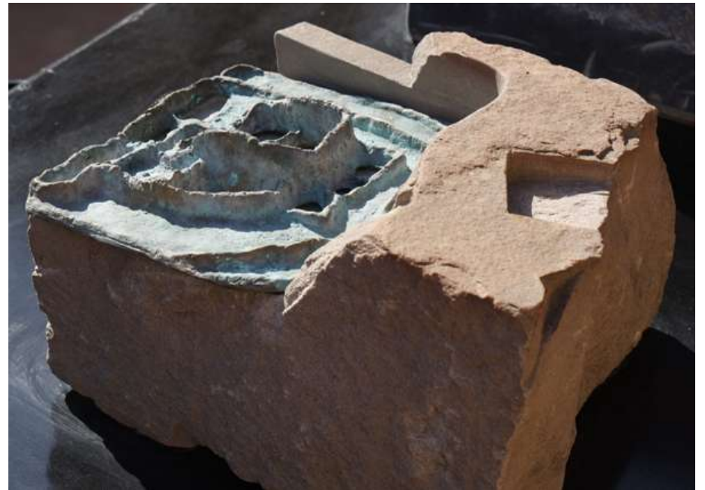
NO. 15 ABANDONED 15 Medium: Stone and Bronze Size: H-8, W-14, D-13 in Year: 2023 - 2025