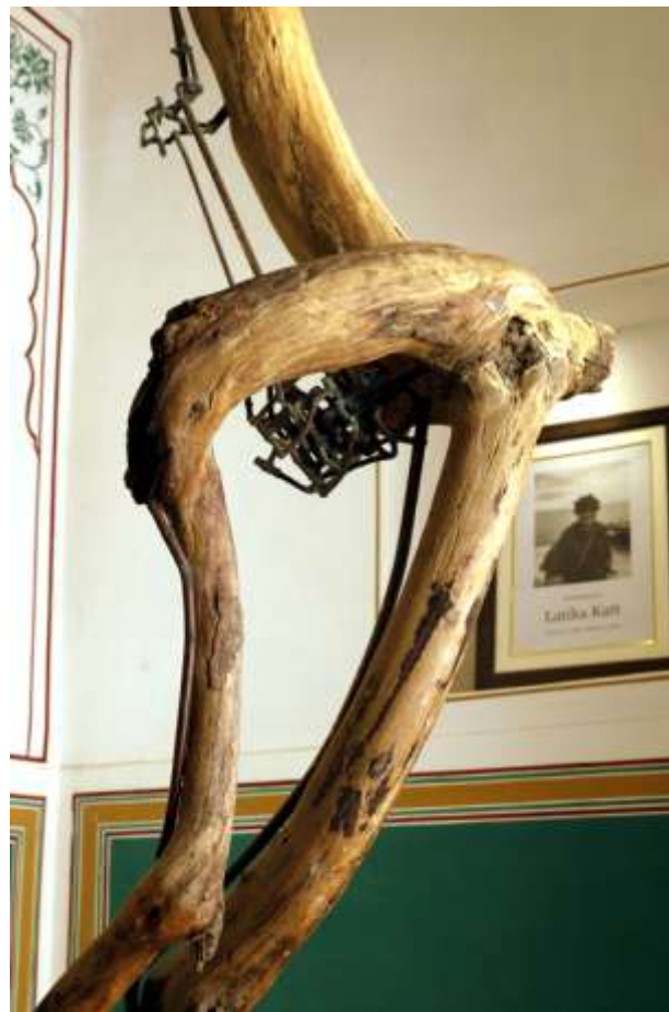
NO. 23 "Growth" Medium: Wood and Copper Size: H-115, W-15, D-23 in Year: 2023