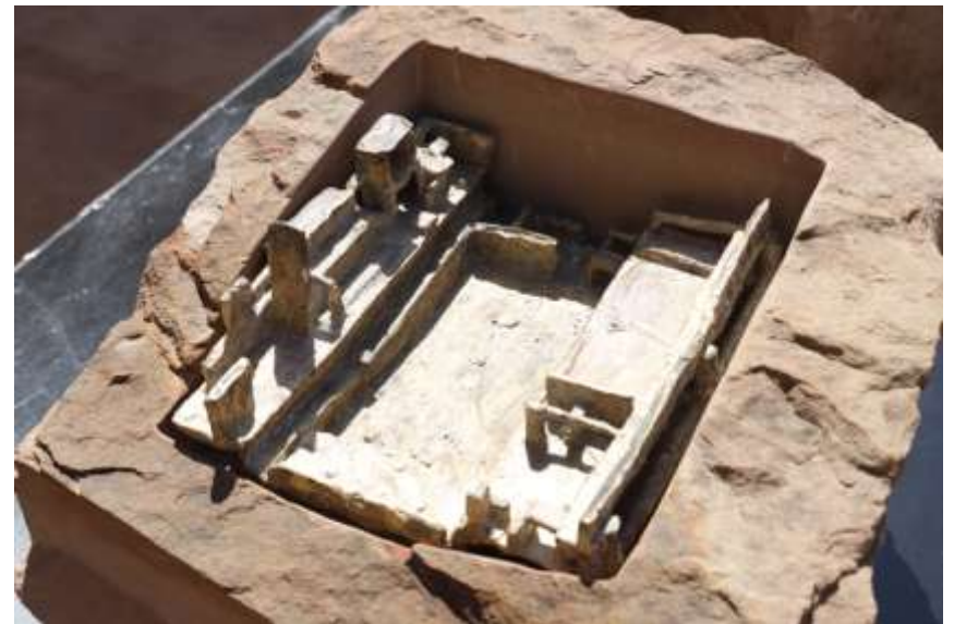
NO. 07 ABANDONED 7 Medium: Stone and Bronze Size: H-10, W-20, D-15 in Year: 2023 - 2025