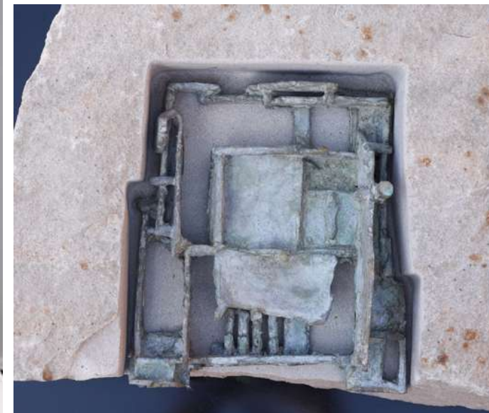
NO. 08 ABANDONED 8 Medium: Stone and Bronze Size: H- 8, W-17, D- 16 in Year: 2023 - 2025