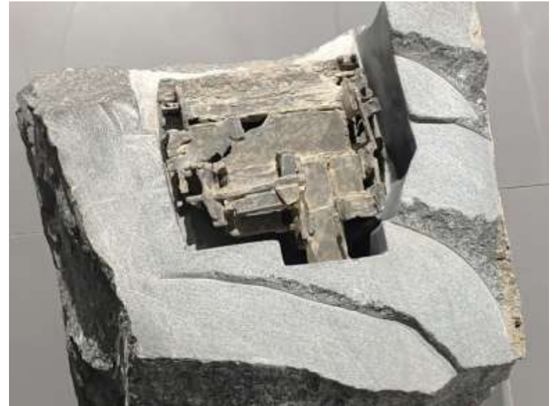
NO. 12 ABANDONED 12 Medium: Stone and Bronze Size: H-12, W-19, D-17 in Year: 2023 - 2025