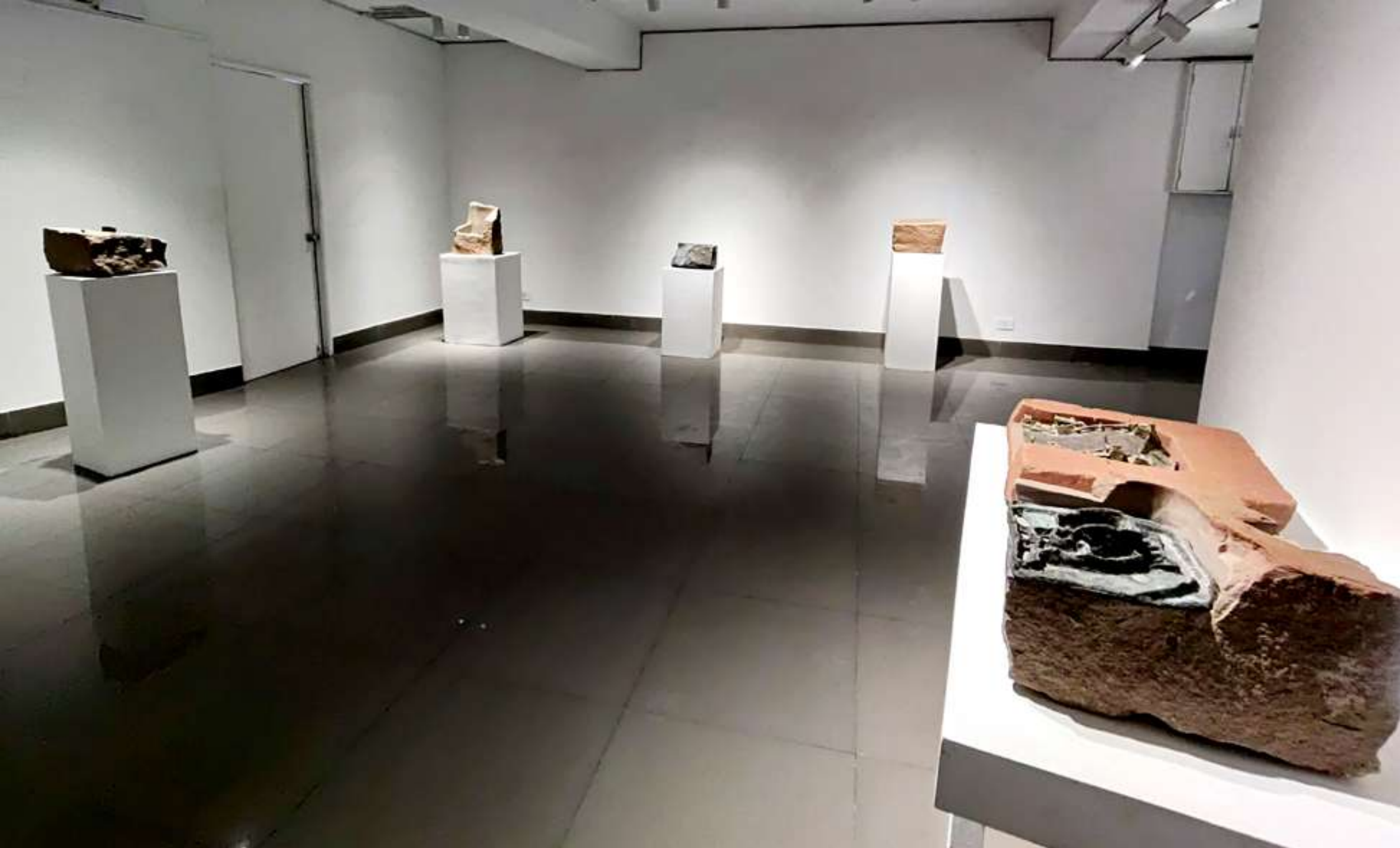
Latika Katt Earth Metal Memory Gallery View