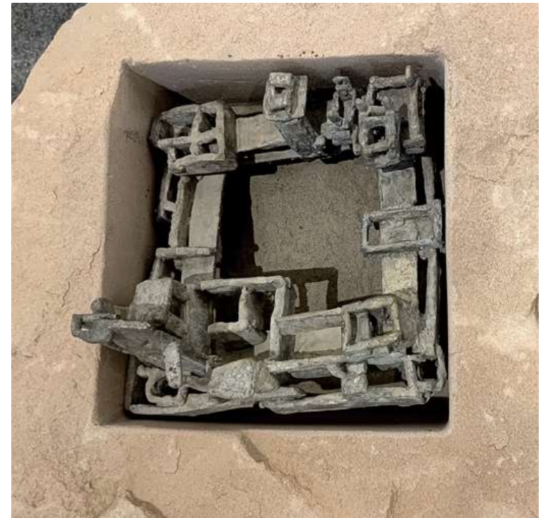
NO. 09 ABANDONED 9 Medium- Stone and Bronze Size - H- 8, W- 15, D- 12 in Year: 2023 - 2025