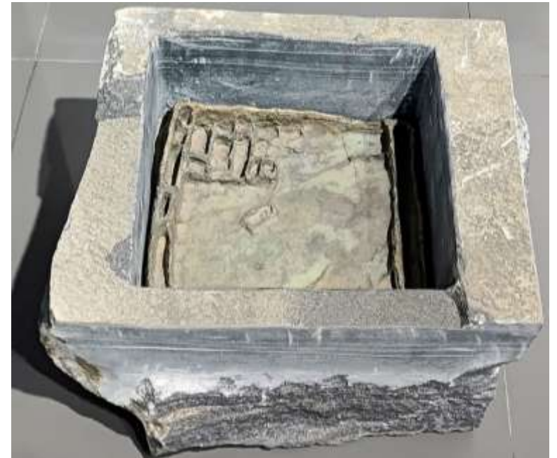
NO. 10 ABANDONED 10 Medium: Stone and Bronze Size: H-12, W- 15, D-12 in Year: 2023 - 2025