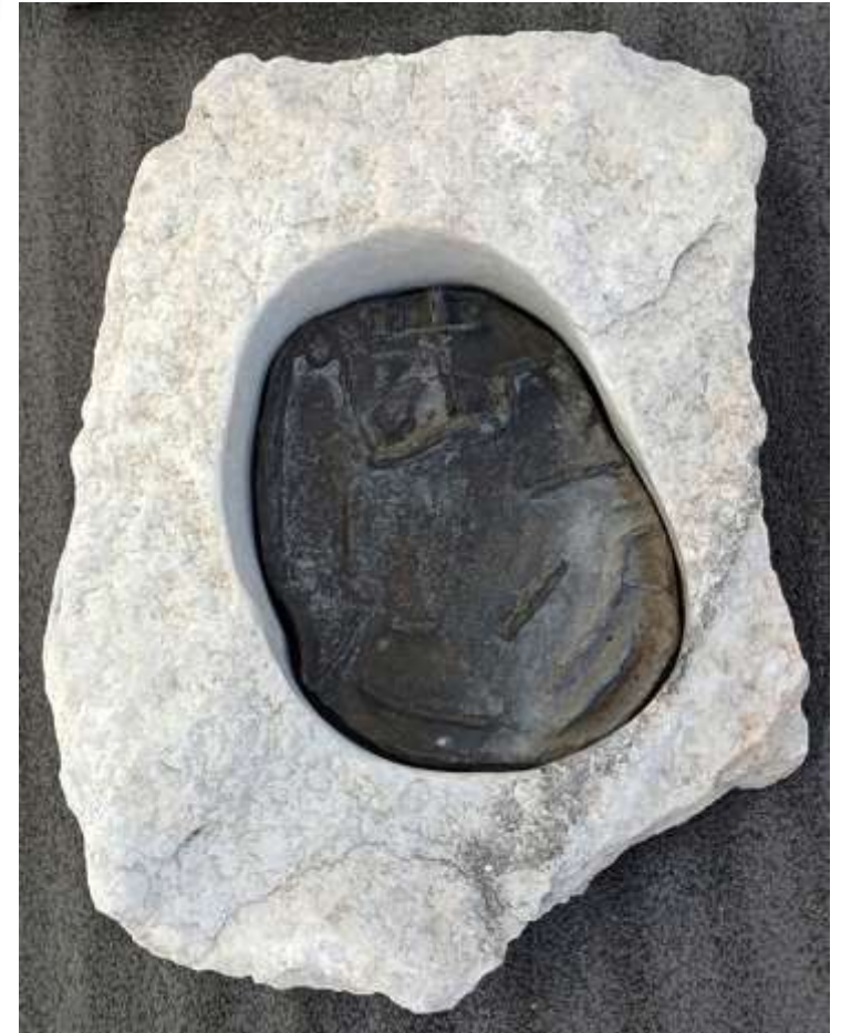
NO. 16 ABANDONED 16 Medium: Stone and Bronze Size: H-8, W-20, D-18 in Year: 2023 - 2025