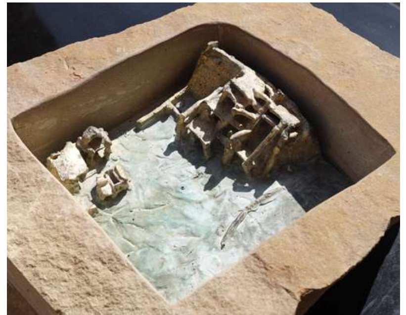
NO. 05 ABANDONED 5 Medium: Stone and Bronze Size: H-9, W-20, D-15 in Year: 2023 - 2025