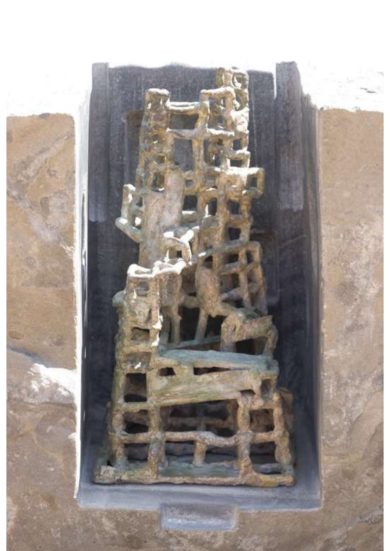
NO. 20 ABANDONED 20 Medium: Stone and Bronze Size: H-15, W-16, B-12 in. Year: 2023 - 2025