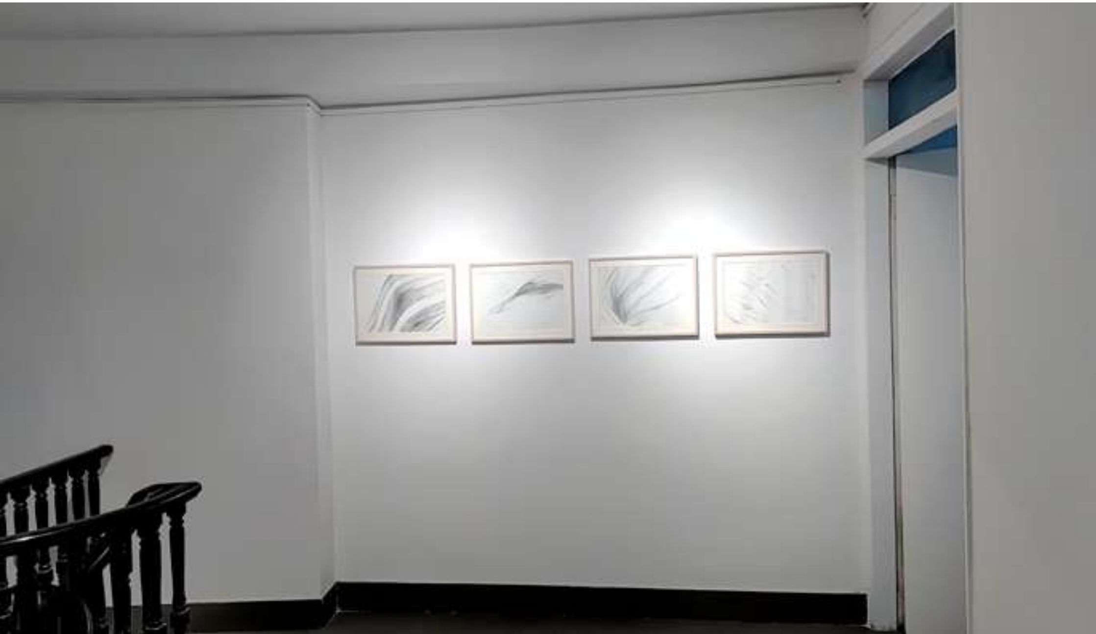
Latika Katt Earth Metal Memory Gallery View