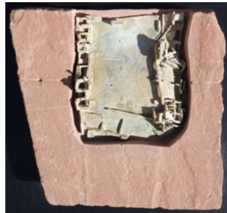
NO. 06 ABANDONED 6 Medium: Stone and Bronze Size: H-4, W-18, D-19 in Year: 2023 - 2025