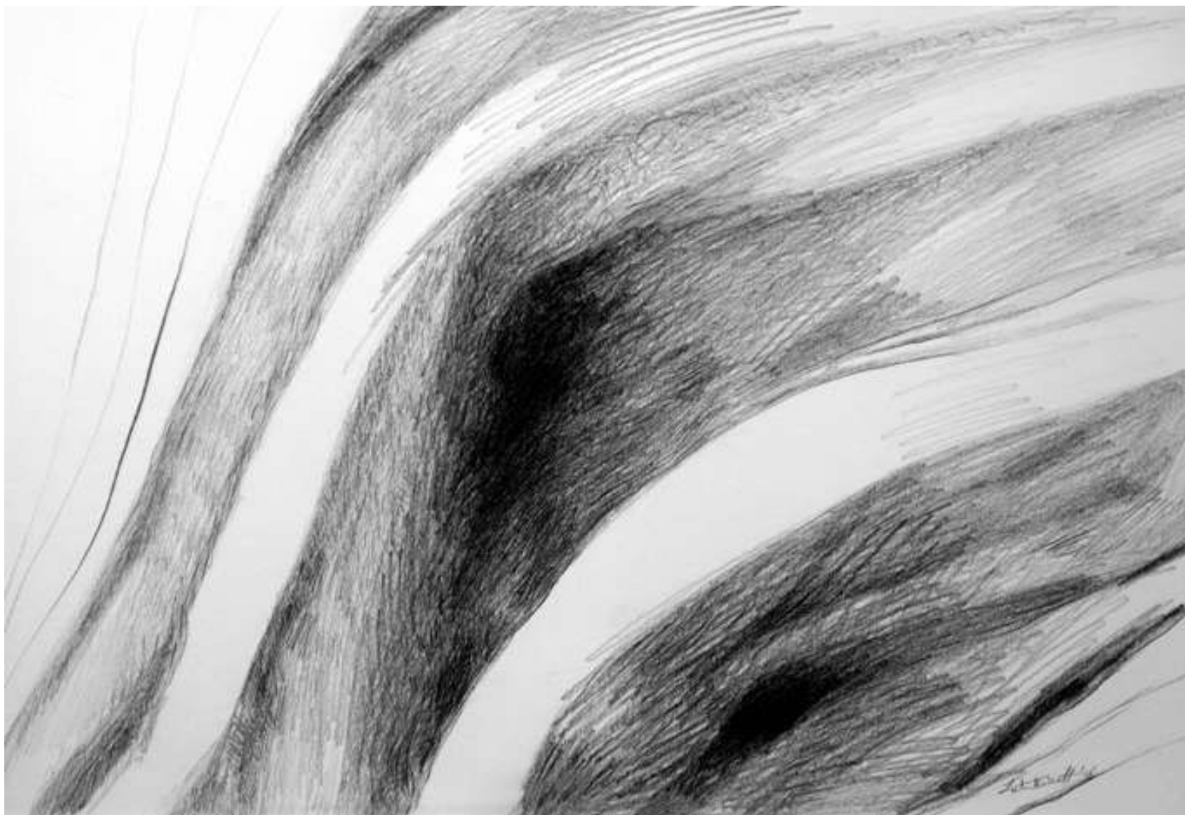
NO. 27 Untitled Pencil Sketch on Paper Size: 11.5 x 16 in. Year: 2016