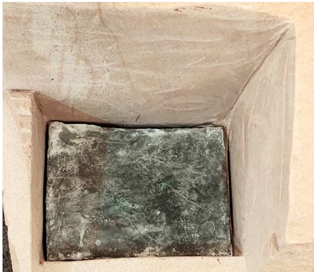
NO. 01 ABANDONED 1 Medium- Stone and Bronze Size: H-18 W-15 D-12 in Year: 2023 - 2025