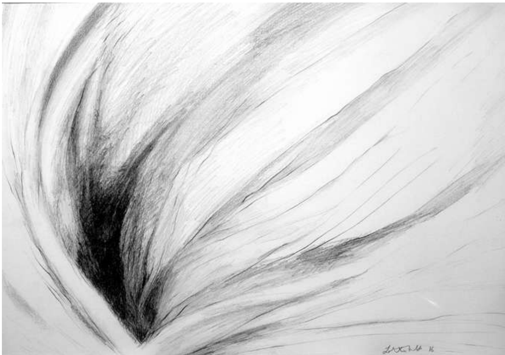
NO. 26 Untitled Pencil Sketch on Paper Size: 11.5 x 16 in. Year: 2016