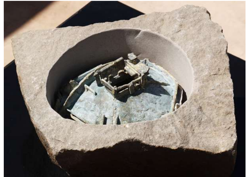
NO. 02 ABANDONED 2 Medium: Stone and Bronze Size: H-11, W-18, D-15 in Year: 2023 - 2025