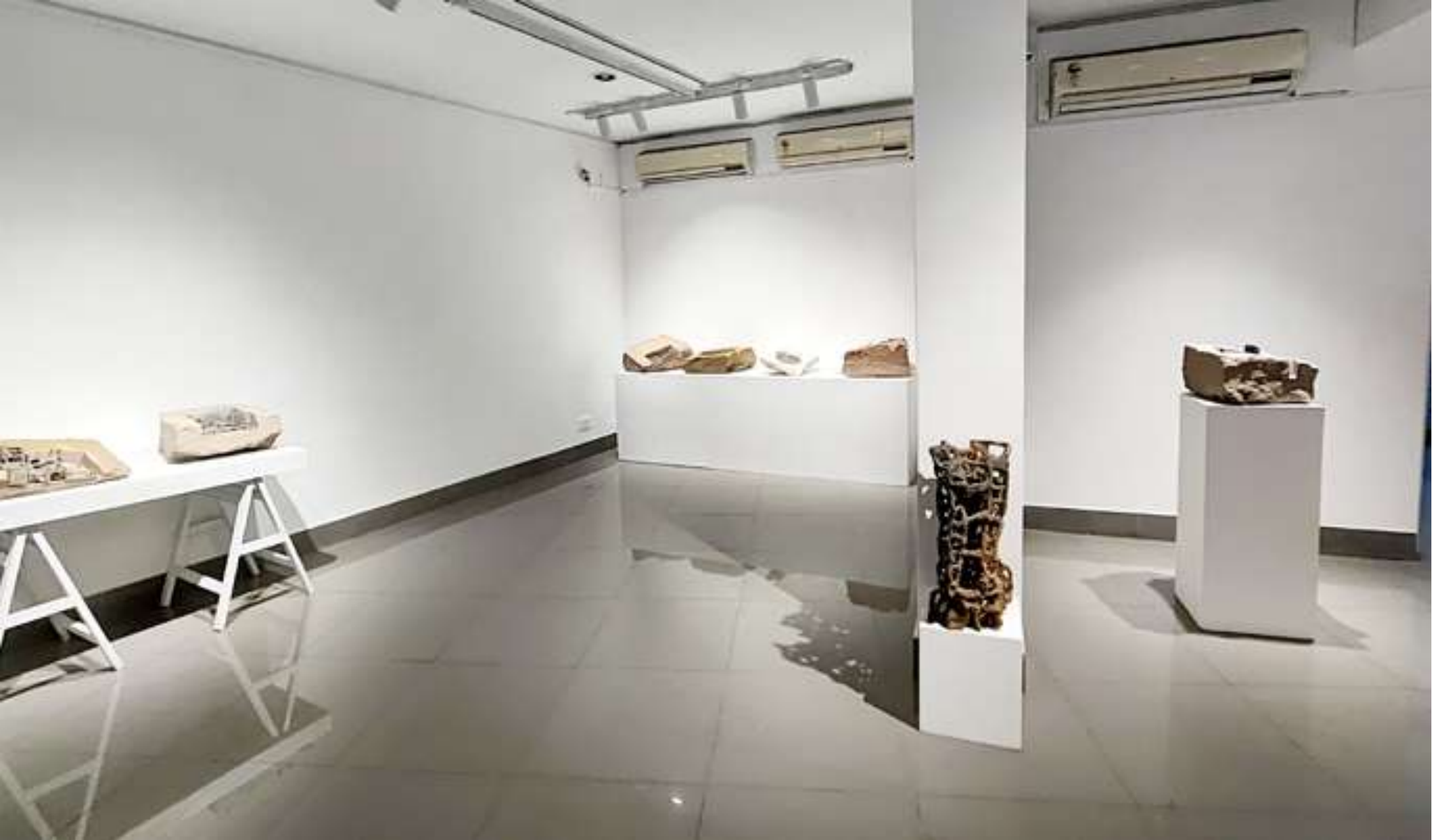
Latika Katt Earth Metal Memory Gallery View