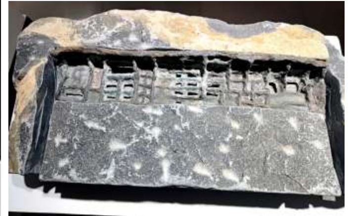
NO. 03 ABANDONED 3 Medium: Stone and Bronze Size: H-5, W-24, D-11 in Year: 2023 - 2025